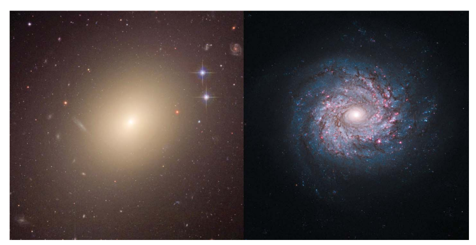
Fig. 1. As shown by the Hubble Space Telescope image of the elliptical galaxy ESO 325-G004 (left), massive galaxies in the nearby universe are overwhelmingly dominated by old red/yellow stars formed more than 10 billion years ago and show little evidence of recent star-formation activity. By contrast, lower-mass galaxies generally continue to form stars in the present day, as shown by the young blue star clusters, red clumps of ionized hydrogen gas, and dark regions of cool dust and gas shown in the Hubble Space Telescope image of the spiral galaxy NGC 3982 (right).

Astronomers are fortunate in having four independent lines of evidence through which to map out the past history of star formation in galaxies.